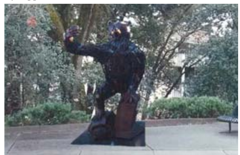
How "Ursus Redivivus" will look once installed on Golden Gate Way.

rather large grizzly bear will to Orinda. Abe relocating to Golden Gate